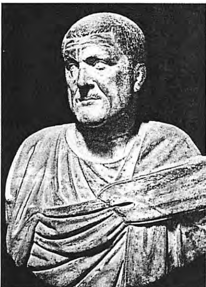
Julius Maximinus, whose great size and strength helped him to rise from his peasant birth to become Roman emperor, was a capable military commander until he was deposed and murdered.

The "best of the Cimbri were immediately cut to pieces," related Plutarch, "for they had linked themselves together with long iron chains passed through their belts in an attempt to preserve an unbroken front." Romans claim that more than 120,000 Cimbri died that day