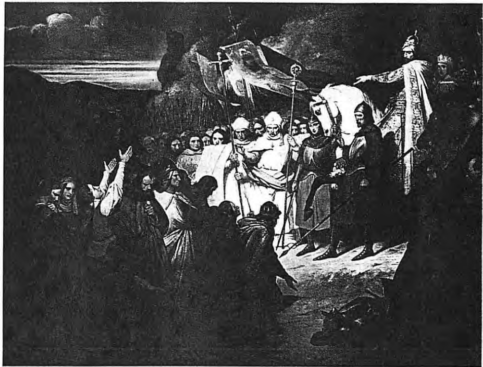
The great Frankish Emperor Charlemagne was known for his size, strength, and intelligence. In Charlemagne Received at Paderborn, by Ary Scheffer, he accepts the surrender of Saxon chieftain Witikind in 785.